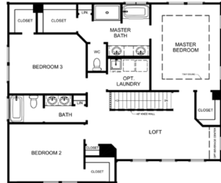
Optional Second Floor Laundry