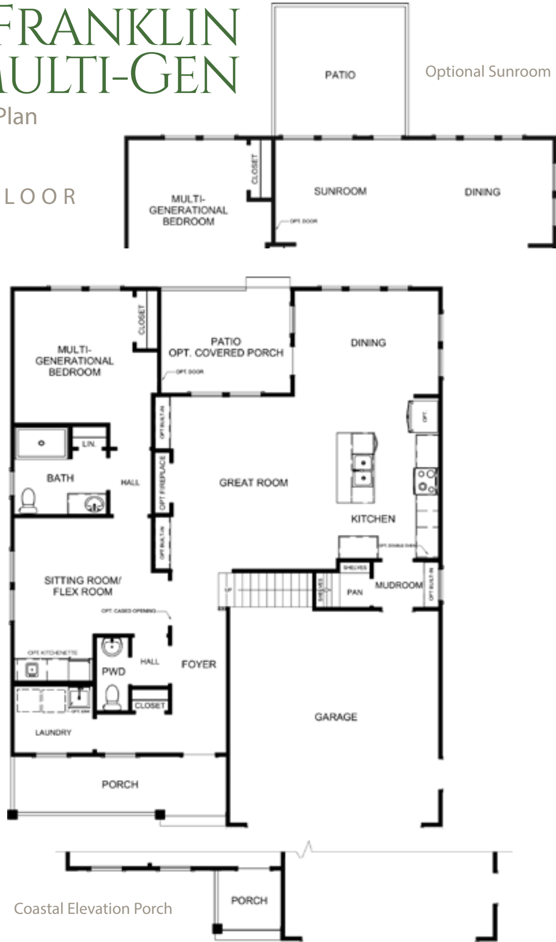
Coastal Elevation Porch