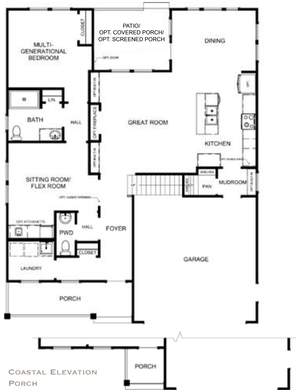
COASTAL ELEVATION PORCH