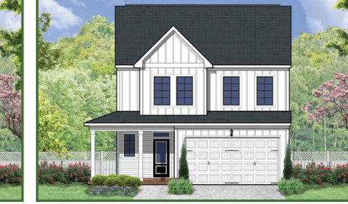
FARMHOUSE FARMHOUSE ELEVATION SHOWN WITH OPTIONAL BLACK WINDOWS