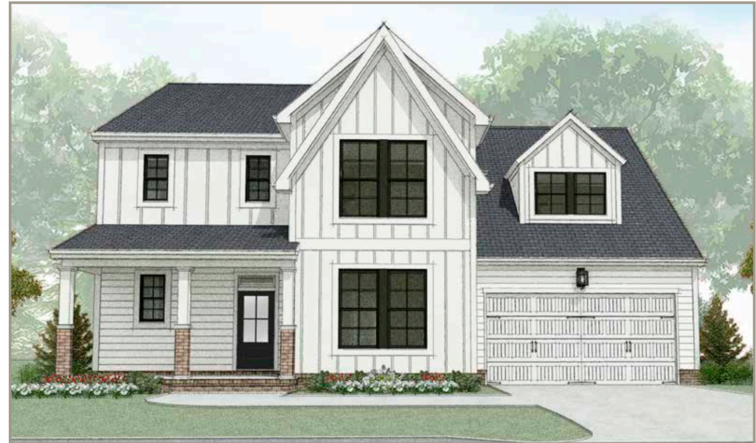
Farmhouse Shown with Optional Black Windows