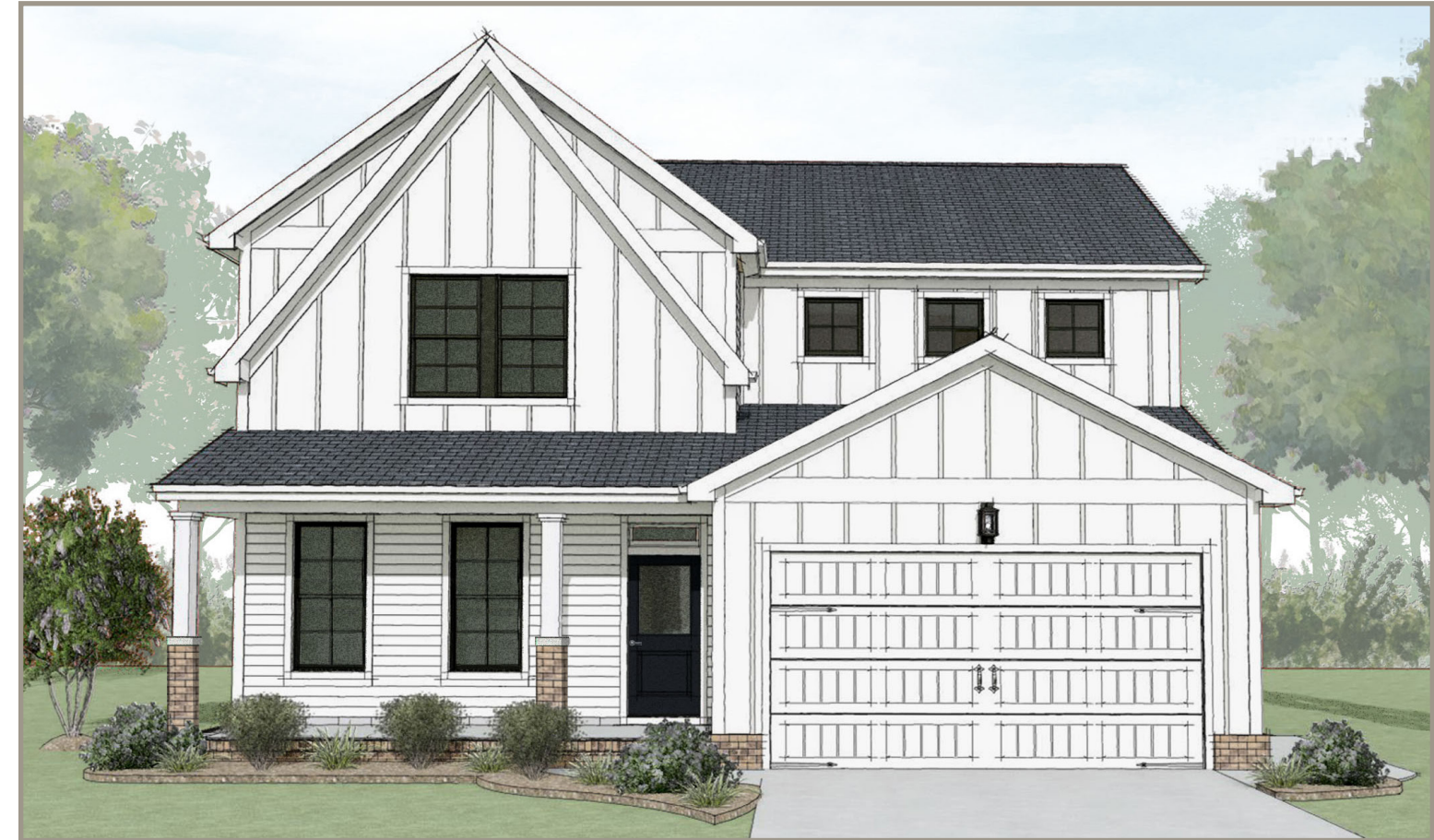
Farmhouse Shown with Optional Black Windows